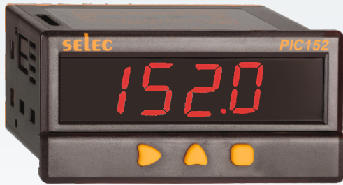
48 x 96mm